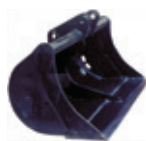
DITCH CLEANING BUCKET 800 mm