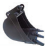
BUCKET 250 mm 300 mm 400 mm