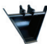
TRAPEZOIDAL BUCKET 550 mm