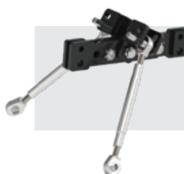
Stiffening tractor frame Category 1 and 2 - Included